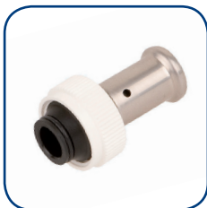
19PK Ø 16-20