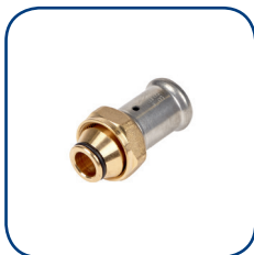
19P Ø 16-20