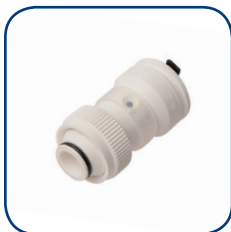
19SK Ø 16-20