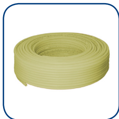
Henco 1L PEXc