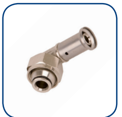
33P Ø 16

* To complete the Ecoline installation you need to have a circulator and thermostatic balancing valve (not in Henco range)