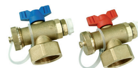
UFH-ESK060303-M Length + 60mm