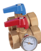
UFH-BTM0606-M Length + 60mm